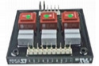
R731 Type Leroy Somer