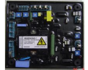
MX341 Type Newage Stamford